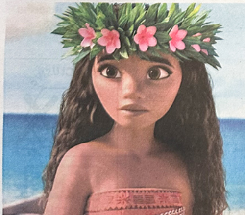
Moana, Disney's 2016 animated musical fantasy adventure set on an island in ancient Polynesia, screens at Wellfleet Public Library.

Moana , Disney's 2016 animated musical fantasy adventure set on an island in ancient Polynesia, screens at Family Movie Matinee at Wellfleet Public Library on Tuesday, April 16, 2 p.m. Free, with snacks and beverages courtesy Friends of the Wellfleet Public Library. See wellfleetlibrary.org for information.